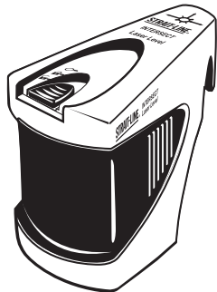
INTERSECT Laser Level