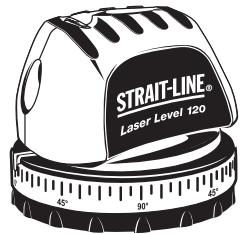
Laser Level 120