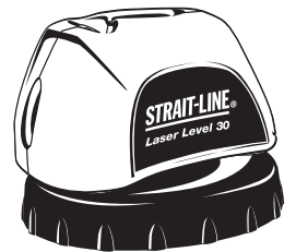
Laser Level 30